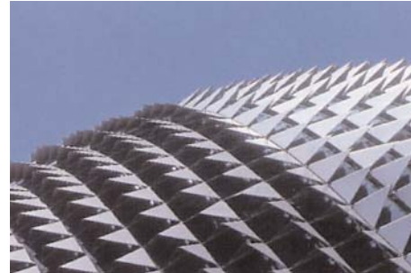
View of external shell (above)

Computer models were developed in-house to allow the many variables to be manipulated in order to derive optimised shade geometry for each facade.