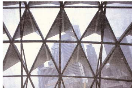
Interior view (above); View on the theatres from above (below)