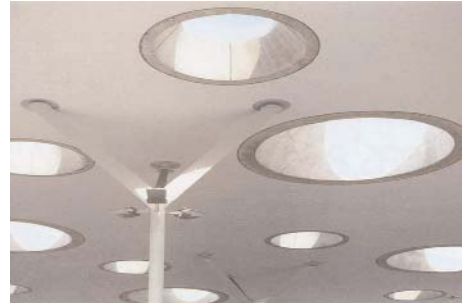
Detail of canopy structure (above)

The station will be finished with a living green roof top to redress the CO 2 imbalance generated by the buses below.