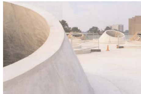
Walsall roof structure awaiting the installation of its earthen roof surface (above)